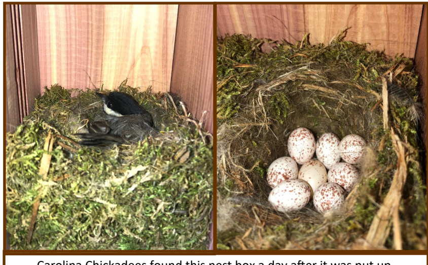
Carolina Chickadees found this nest box a day after it was put up.

While birds are fabulous to watch and listen to, plants also help make a backyard diverse and a joy to explore. Living a "green" life, I'm not into