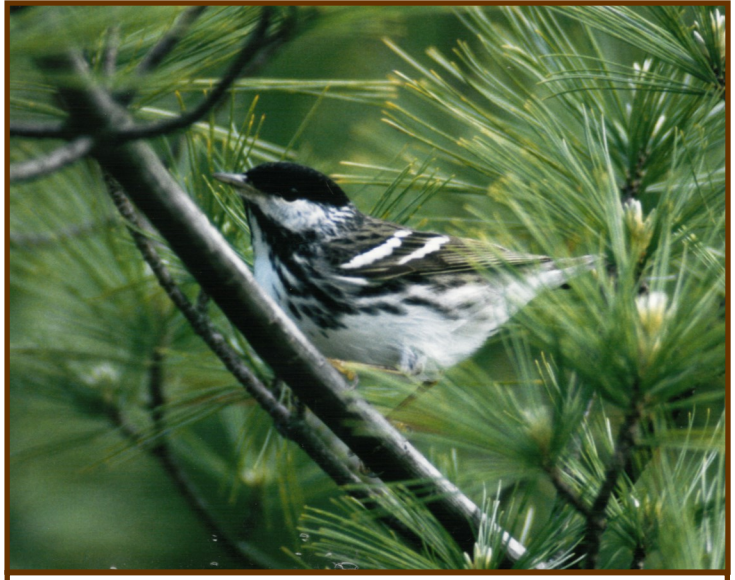
Blackpoll Warbler

As a wannabe avid birder, I am always on the lookout for who is nesting in my yard. Northern Cardinals, House Wrens, Barn Swallows, Brown Thrashers, Chipping Sparrows, Baltimore Orioles, Yellow Warblers, and more... that's only part of the list. The other part is the birds I've heard but not confirmed: Blue-Gray Gnatcatcher, Mourning Dove, White-breasted Nuthatch, Downy Woodpeckers, and others I've invariably missed. As for passersby, the migrants make springtime super fun! Of all the migrants though, one was particularly a surprise. While heading out for the day, I heard an unfamiliar sound, although mildly reminiscent of an Allard's Ground Cricket. Knowing the crickets would not be