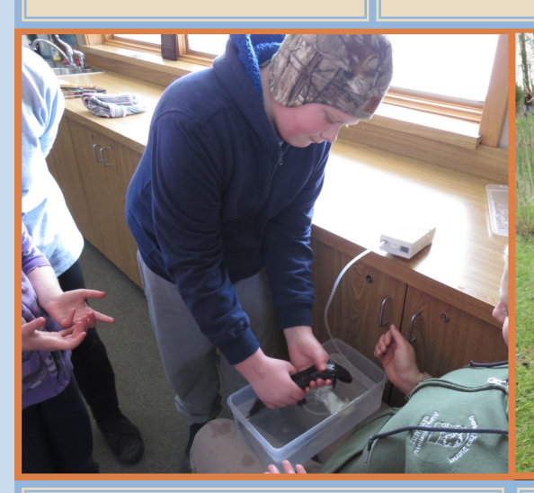
Just Hike it!