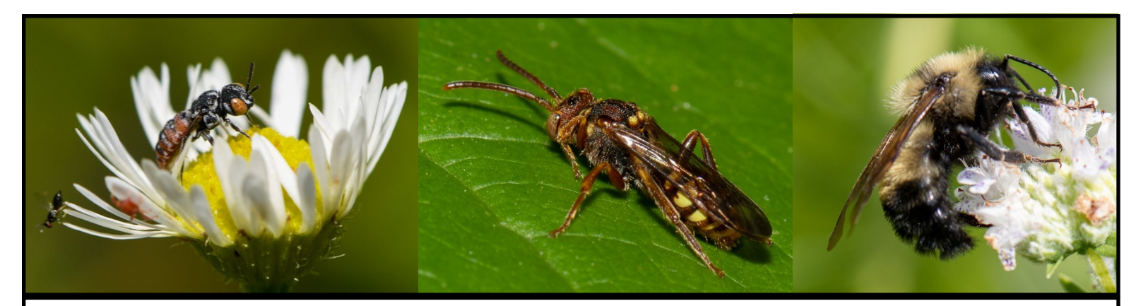
Left to right: Calliopsis Cuckoo Bee, unidentified nomad bee, Lemon-cuckoo Bumble Bee. Cuckoo bees forgo the work of pollen collecting, instead stealing food from other bee species.

Another group of bees susceptible to population declines is cuckoo bees. Rather than doing the work of building nests and gathering pollen, these bees are kleptoparasites. They steal food by laying their eggs in the nests of other bee species. This is comparable to the cowbirds and cuckoos (for which the bees are named), that lay their eggs in other birds' nests. Most cuckoo bees resemble wasps, as they lack fuzzy hairs bees typically use for pollen storage. Though cuckoo bees seem lazy, they are a sign of healthy bee populations and are super interesting to insect nerds like me!