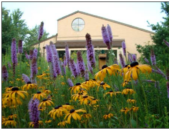
Lowe-Volk Park Nature Center

The Lowe-Volk Park Nature Center opened in December of 2002. Inside, are interpretive exhibits, live wildlife displays, murals and a Window on Wildlife.